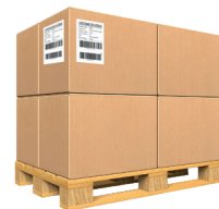
APL 60S 2 LABELS 3 pallets/min*

Due to our continuous improvement policy, our product specifications are subject to change without notice.