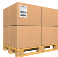
APL 60S 1 LABEL 10 pallets/min*